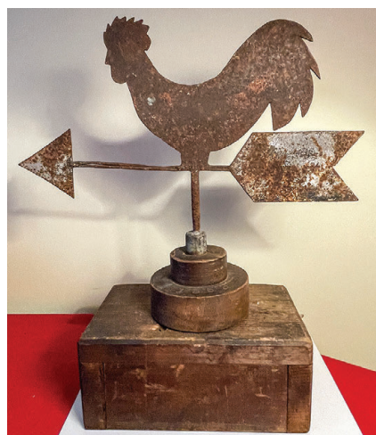
Cast-iron cutout rooster weathervane.