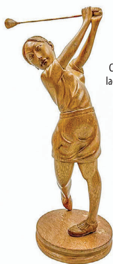
Carved mahogany lady golfer from the 1950s.