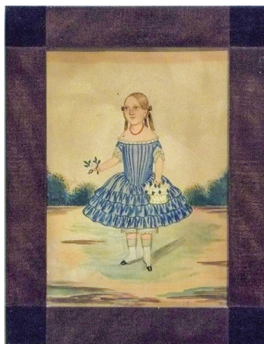
Watercolor of a girl in a blue dress holding a basket of flowers, mid-19th century.