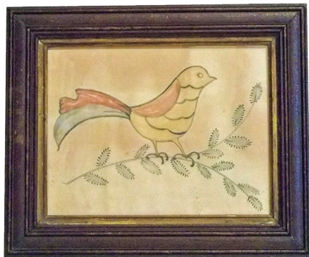
Watercolor of a robin, 19th century, possibly Pennsylvania.